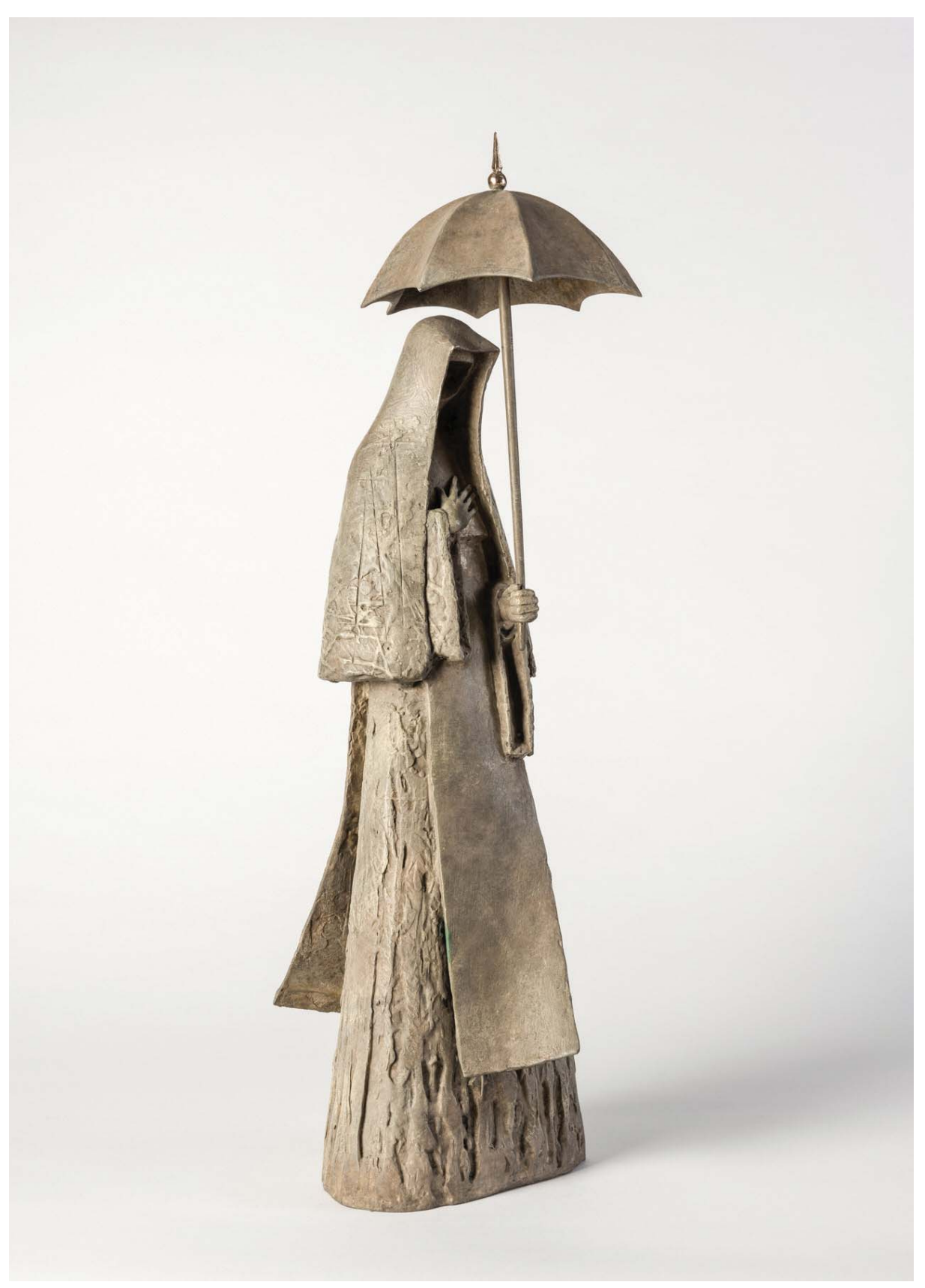
It Raineth Even on the Just Height 61cm Edition of 8