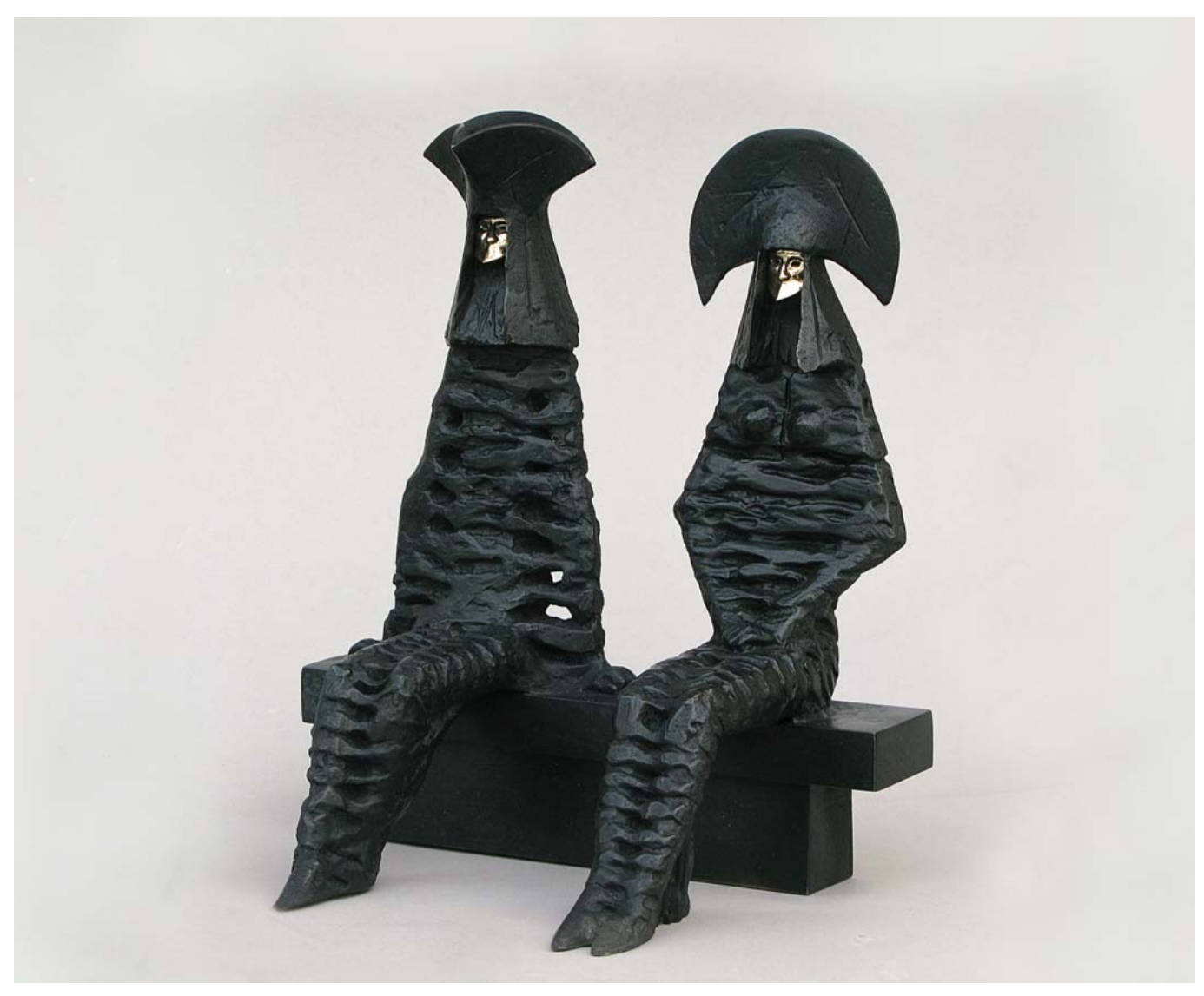
The Grandees Height 25cm Edition of 8