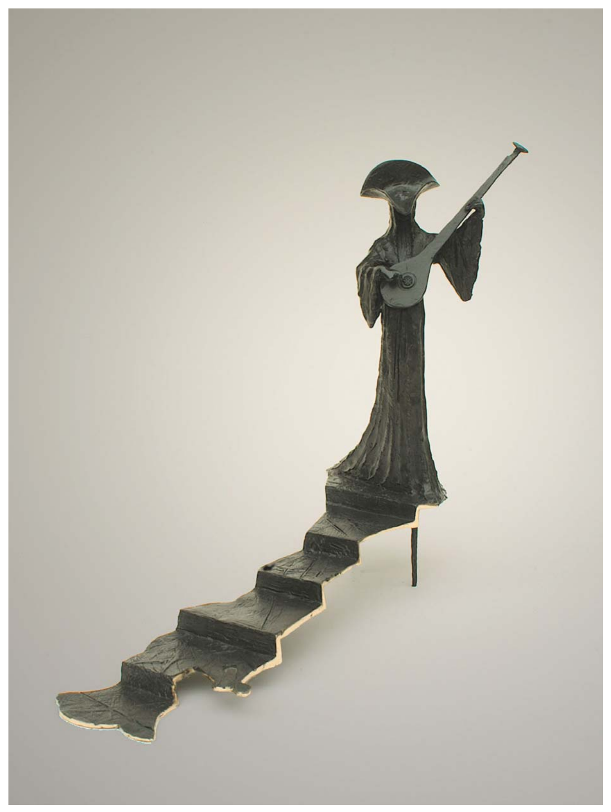
La Bella Luna Height 28cm Edition of 8