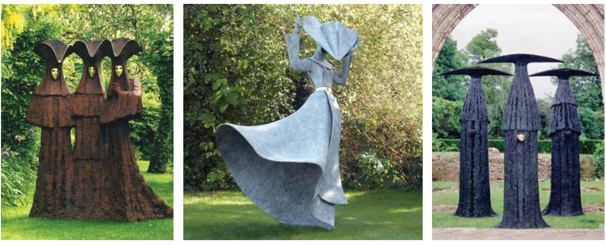
Serenissima, Height 250cm