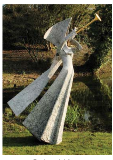
Exultate Jubilate, Height 216cm