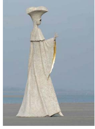
Pas de Basque, Height 190cm