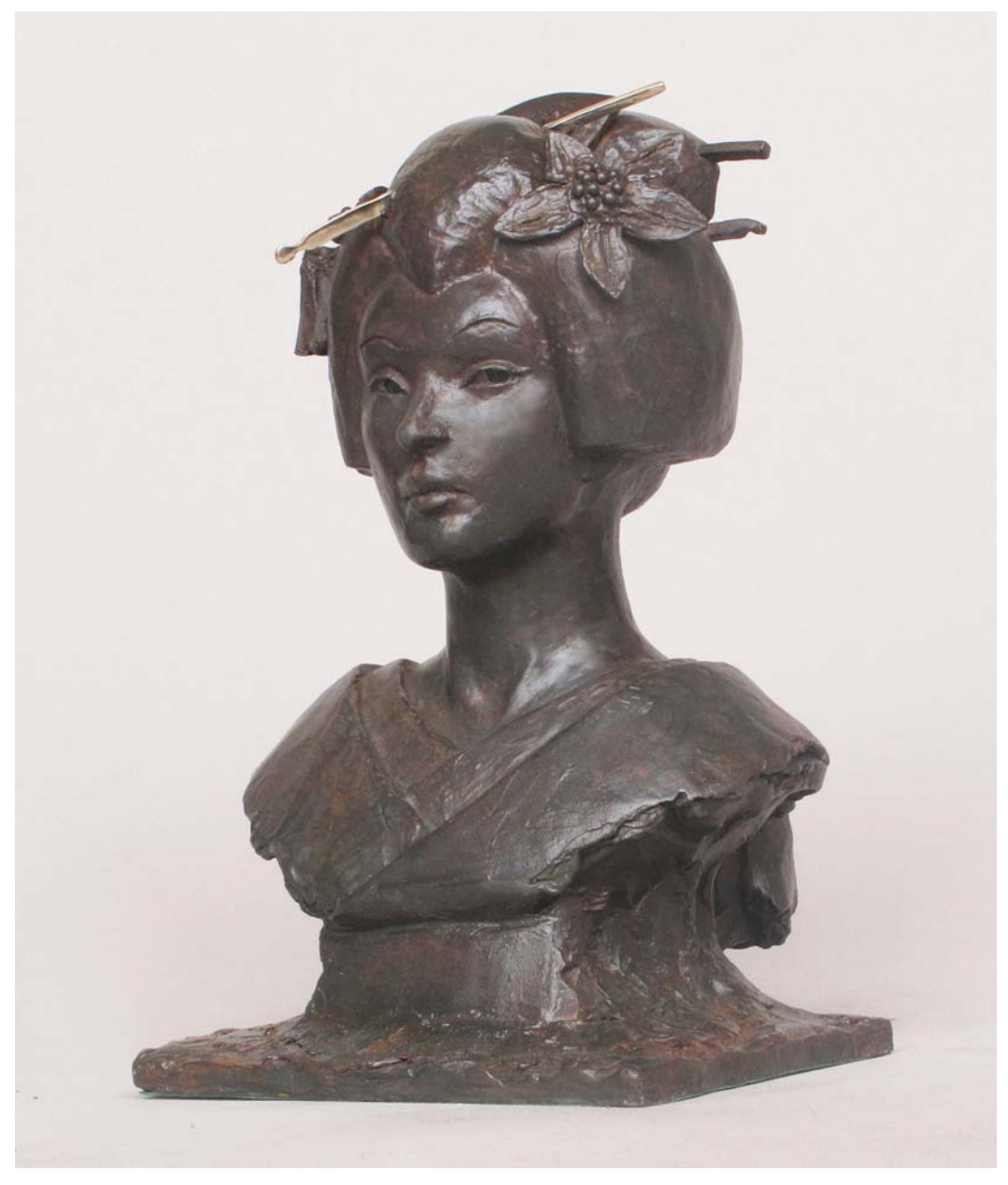
Maiko Height 21 cm Edition of 8