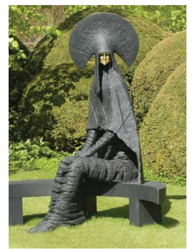
Moonstruck, Height 198cm