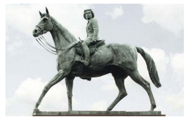
HM The Queen