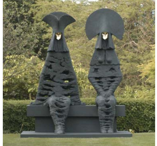
The Grandees, Height 242cm