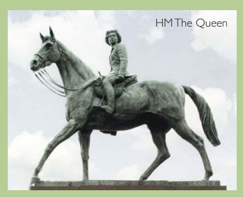
for independence. Prime Minister David Cameron described it as "a magnificent tribute to one of the most towering figures in the history of world politics."

Then, in 2015, Philip completed a statue of one of the 20th century's most revered statesmen: Mahatma Gandhi. The commission in London's Parliament Square marked the 100th anniversary of Gandhi's return to India to start the campaign