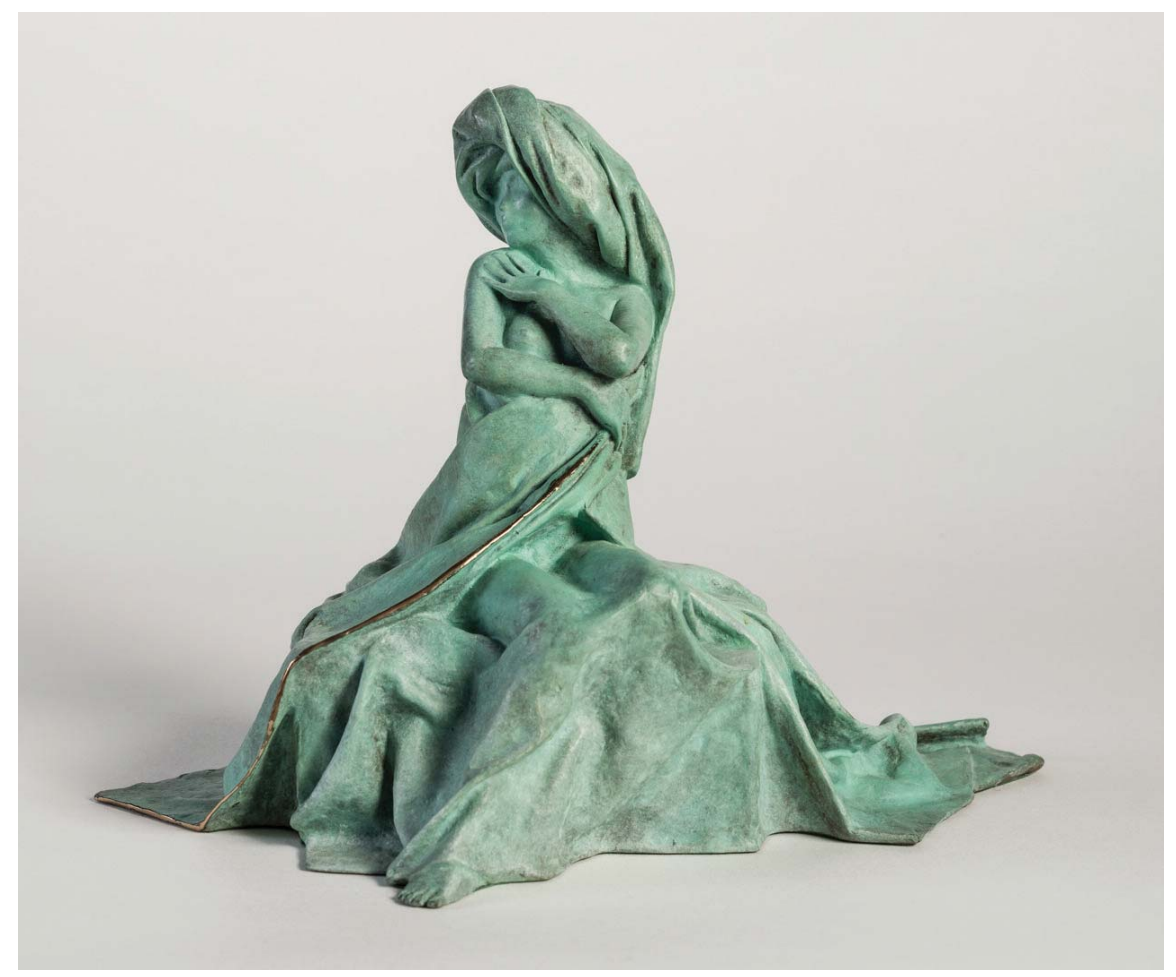
Susanna without the Elders Height 20cm Edition of 8