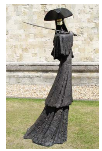
The Swordmaster, Height 220cm