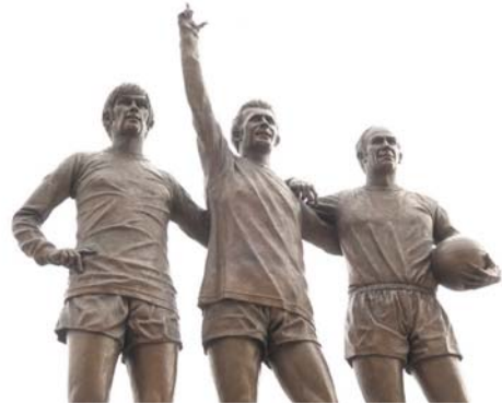
The United Trinity, Manchester