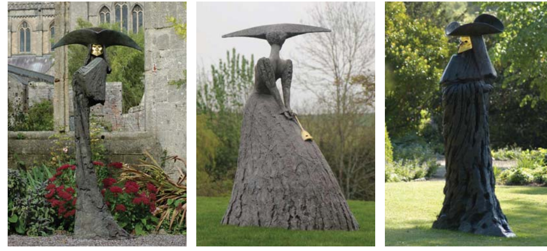
The Don, Height 212cm