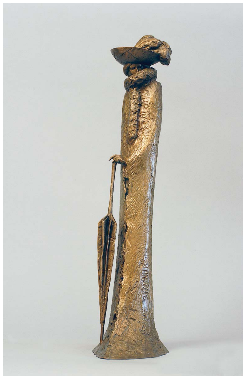
The First Snow of Winter Height 54cm Edition of 8