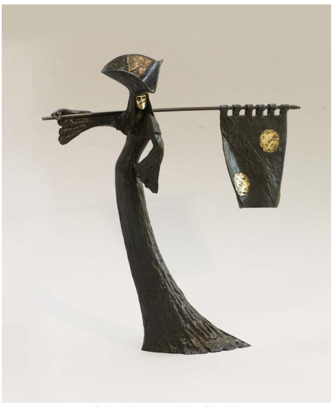
The Standard Bearer Height 38cm Edition of 8