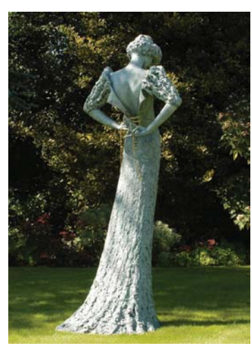
The Last Ball of Summer, Height 210cm