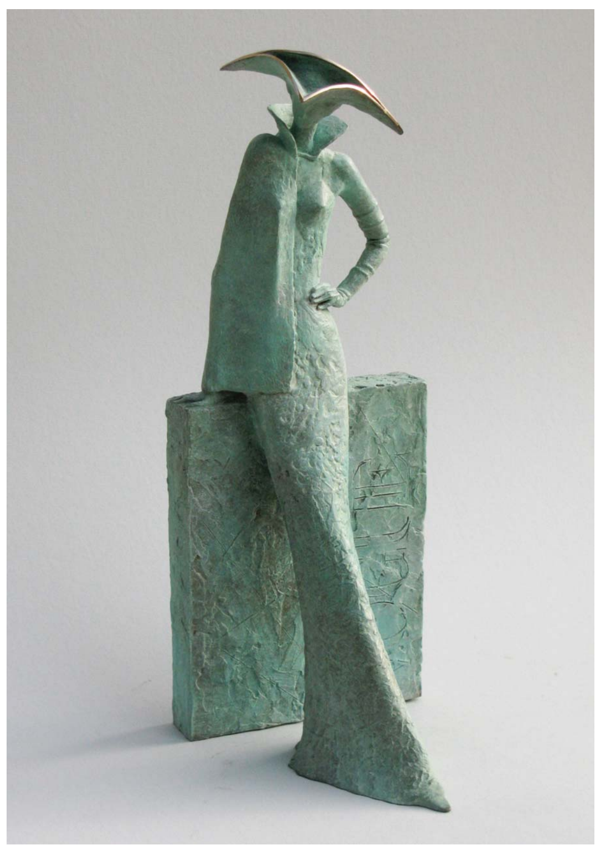
In Vogue in Venice Height 47cm Edition of 8