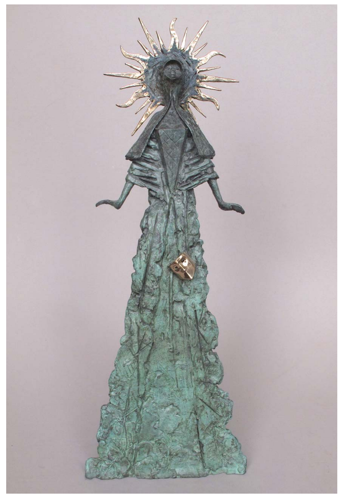
Court of the Sun King Height 53cm Edition of 8