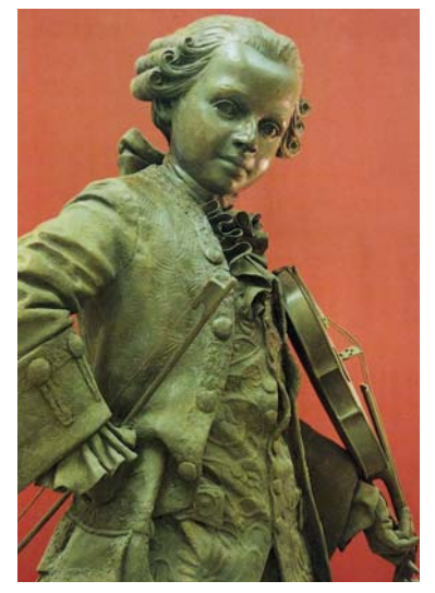
The Young Mozart