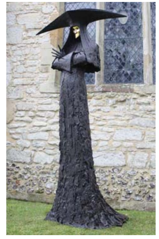
The Magistrate, Height 218cm