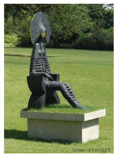
Queen of the Night, Height 145cm