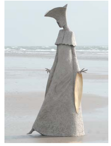
Saraband, Height 190cm