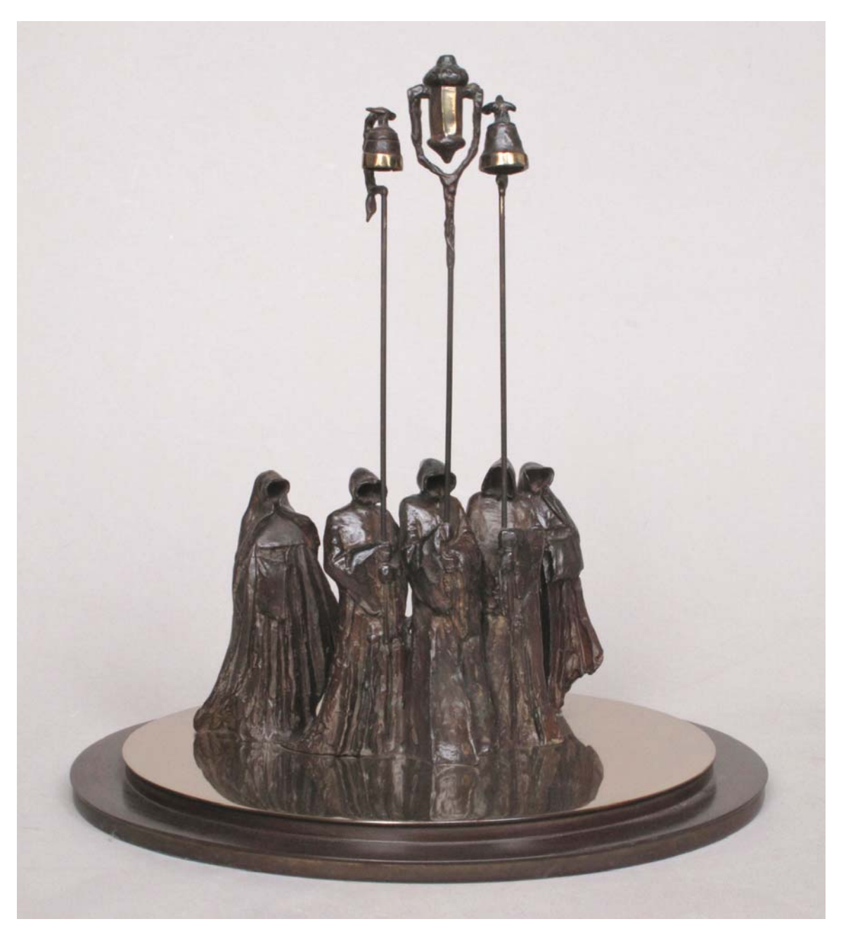
Candlemas Height 28 cm Edition of 8