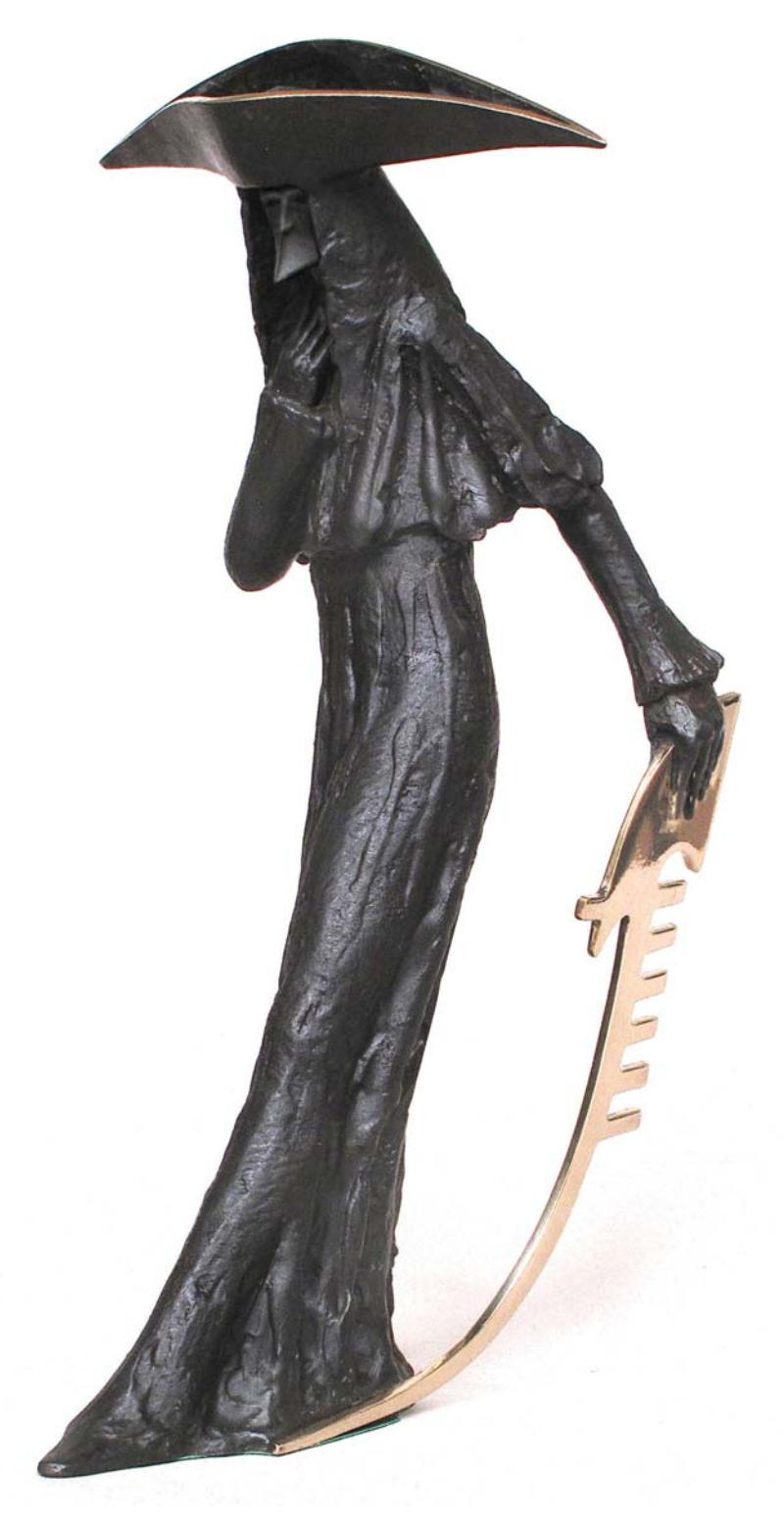
The Boat Master Height 29cm Edition of 8