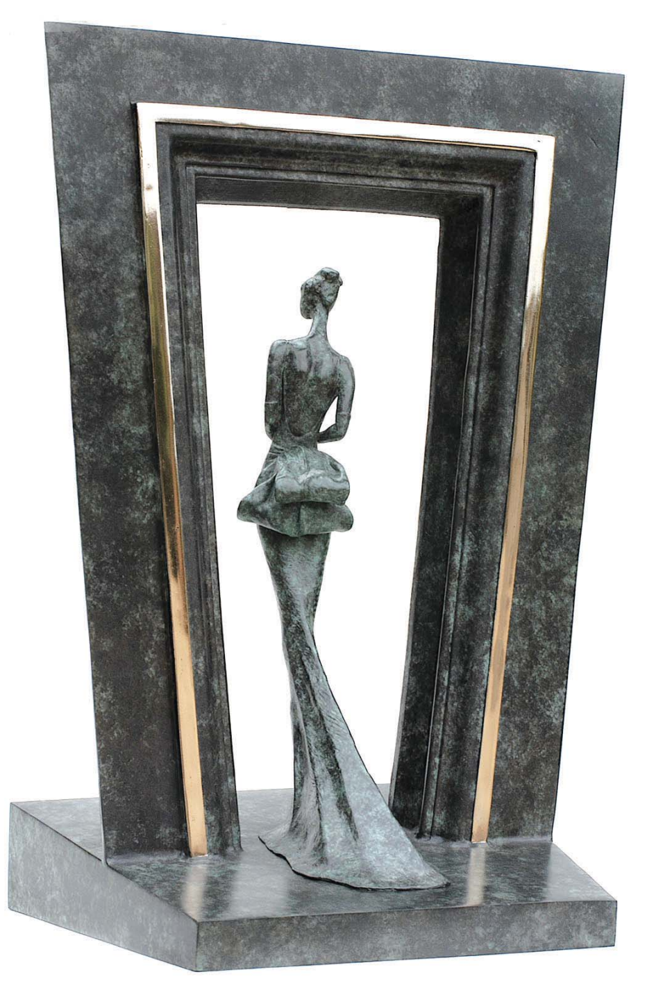
Making an Entrance Height 56 cm Edition of 8