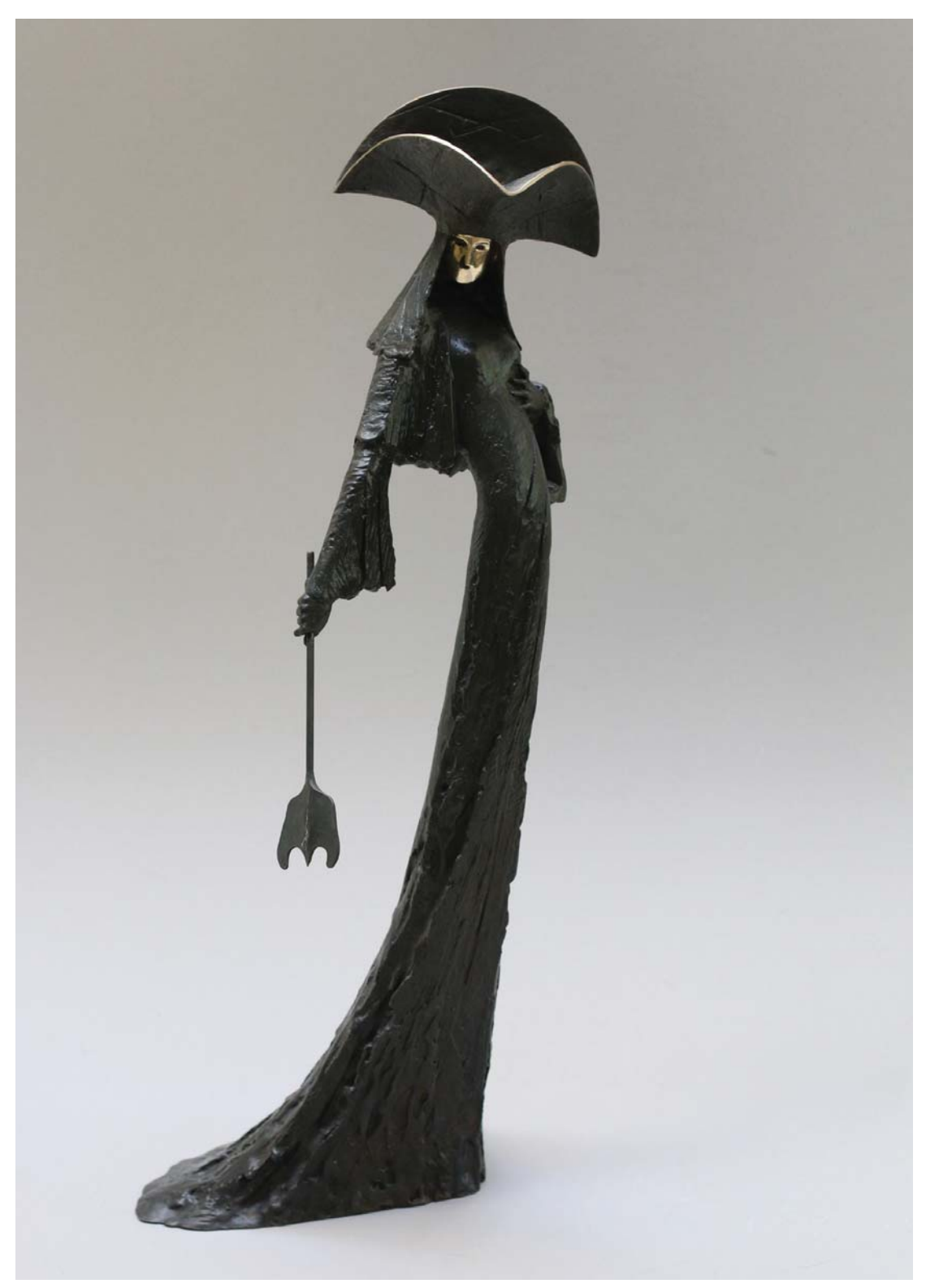
Salieri's Fan Height 64cm Edition of 8