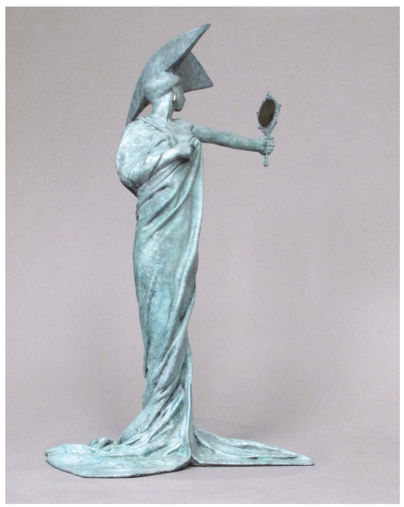
The Pearl Earring Height 41 cm Edition of 8