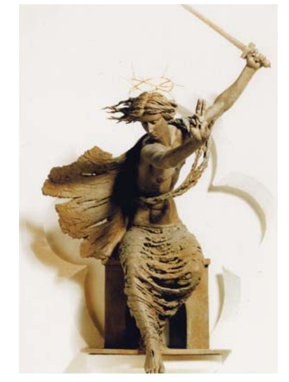
Christ in Judgement