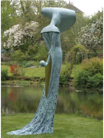
Skittles with Scarlatti, Height 200cm