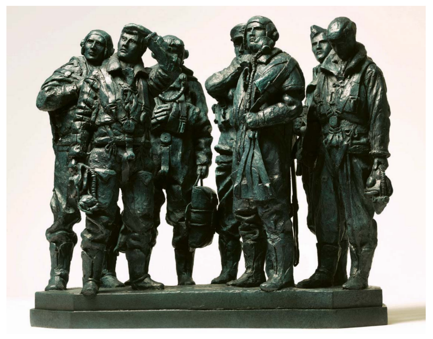
Maquette of Bomber Command memorial sculpture Height 43cm Width 48cm Depth 25cm Edition of 20